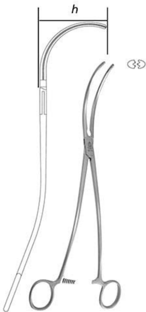
Cyst Cervical Atraumatic Forceps