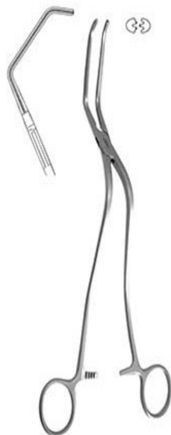
M70050 24cm 深