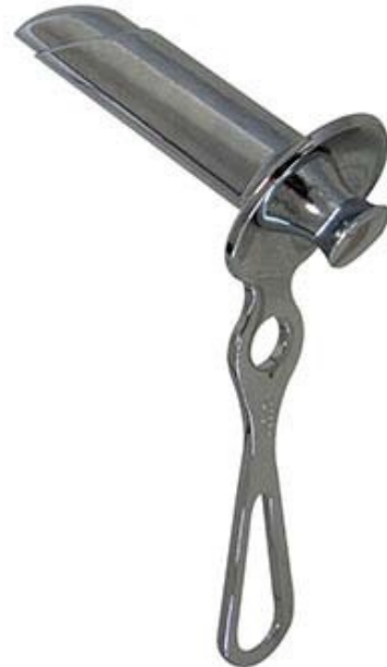
直型 (斜口) Bevel Connection