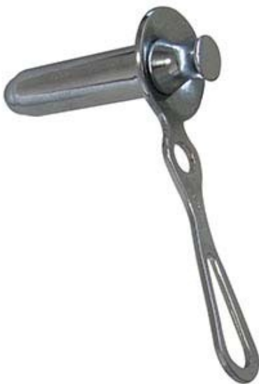
直型 (平口) Straight Connection