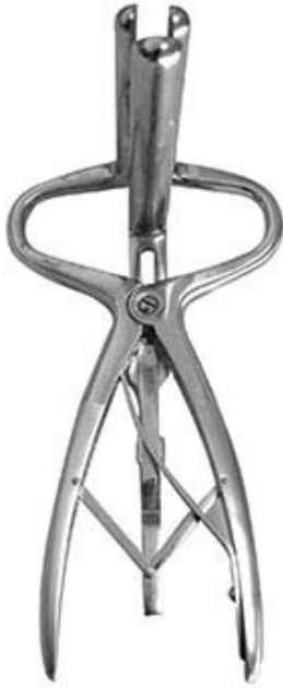
三叶 Three Petal