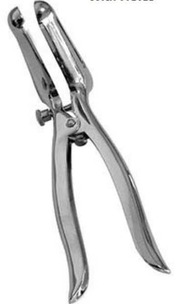
双叶 (有孔) Two Petal With Holes