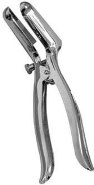
双叶 (无孔) Two Petal Without holes