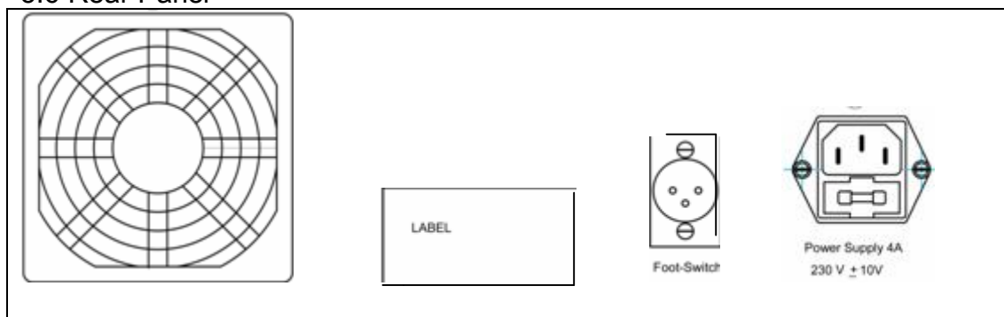
Rear Panel of Apparatus

Rear panel of computerized high frequency electrotome includes: power supply socket, fuse seat, foot pedal socket, grounding connecting terminal, product nameplate and fan.