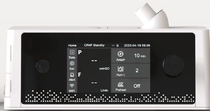
e.g. Model 20A-WP,25SA-BP