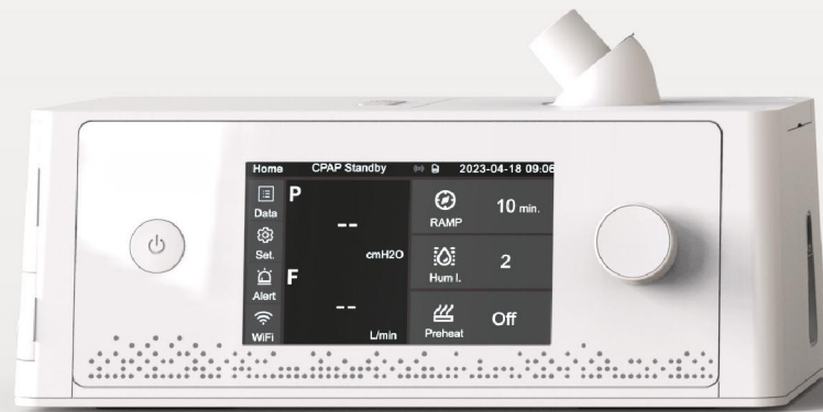
e.g. Model 20 C-G