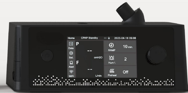
e.g. Model 30STA-BP